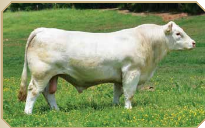
JDJ MAXIMO A18 P

A beautiful combination of Maximo on Royce daughters that is "nicking" so well in our program. She has the great calving ease and birth weight numbers that Maximo is earning as a great heifer calving bull reputation with superior growth afterwards. This heifer will have abundant milking ability along with a very quality udder. Her Cigar influence adds extra credibility to her lineage.