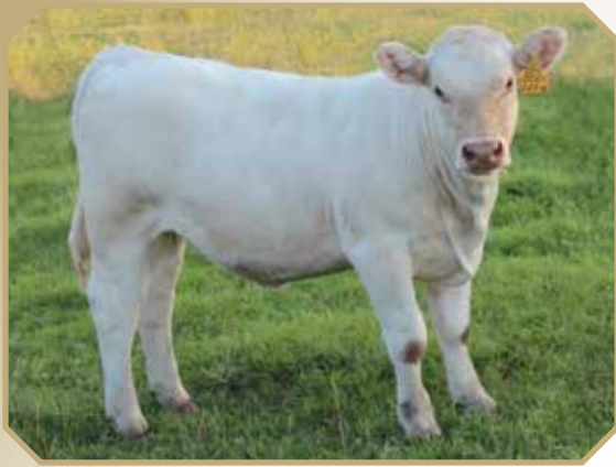
DOUBLE-H BELL 802F selling as Lot 64