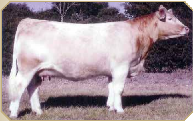
DA MS MARION 328 P ET Donor dam of Lot 65