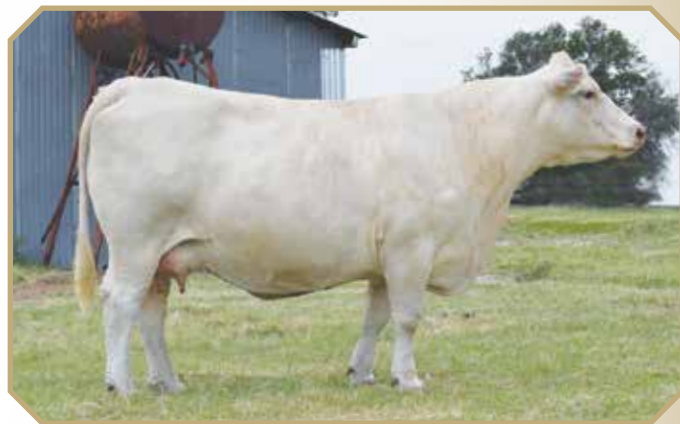
CWC DAISY U820 Donor dam of Lot 50

LT LEDGER 0332 P WC CAPITAL GAIN 2220 P ET EM815504 JWK CLARICE J139 ET SR/NC FIELD REP 2158 P ET CWC DAISY U820 F1097381 DVCR LADY MONTANA 224 P LT BLUEGRASS 4017 P LT BRENDA 6120 PLD VCR SIR DUKE 914 PLD JWK CLARICE D050 ET LHD MR PERFECT Y416 SR LADY EASE 914 ET RC MONTANA 644 POLLED DVCR IMPRESSIVE 994 P