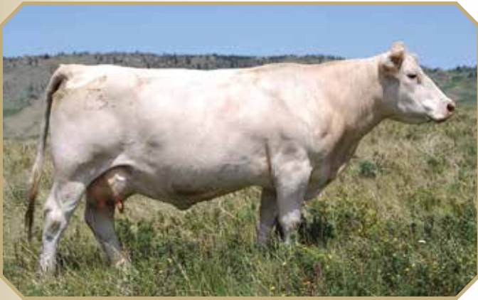
JDJ MS SPUR R120 Maternal granddam of Lot 47 embryos & donor dam of JDJ True Mark T39, JDJ Duplicity Y420 and JDJ Resource Z365