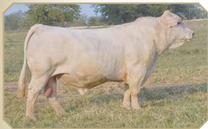
LT RUSHMORE 8060 PLD