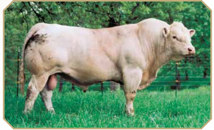
JDJ SMOKESTER J1377 P ET Sire of Lot 70 embryos