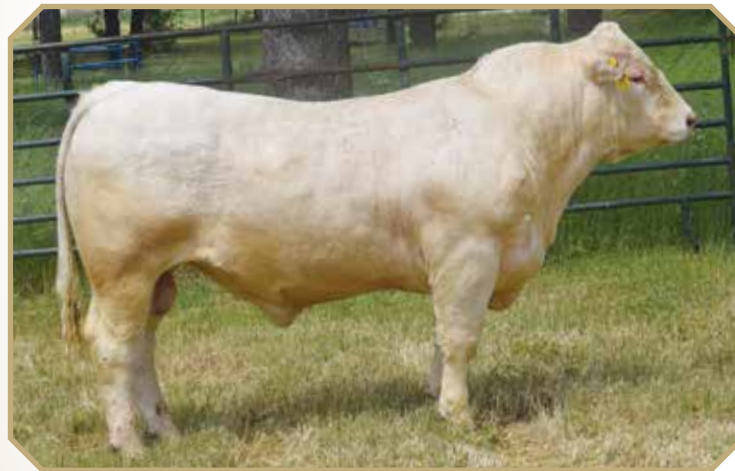
DC/JDJ PEGASUS D3330 P