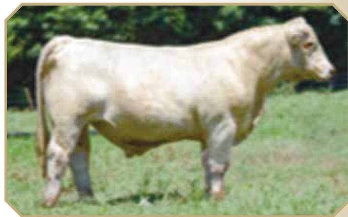
PS MAKE IT RAIN His service sells!