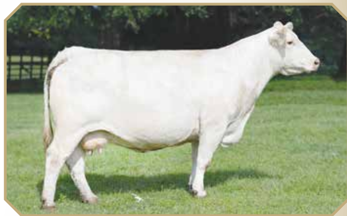
DOUBLE-H TLC MARION 0429 Donor dam of Lot 68 embryo

LT ASSERTION 1277 P LT BLUEGRASS 4017 P M686569 LT PEARL'S BREEZE 2236 P LT EASY BLEND 5125 PLD HCF AIREY 9006 PLD F1117005 HCF BREEZY 7094 EATONS ASSERT 9171 LT ALLI'S CLASS 9140 P LT WYOMING WIND 4020 PLD LT UNLIMITED PEARL 7053P LT UNLIMITED EASE 9108 LT BRENDA 1014 PLD LT WESTERN SPUR 2061 PLD LT AIREY 9016 POLLED