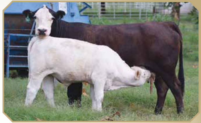
RS MS SLICK F73 selling as Lot 34; pictured with recip dam