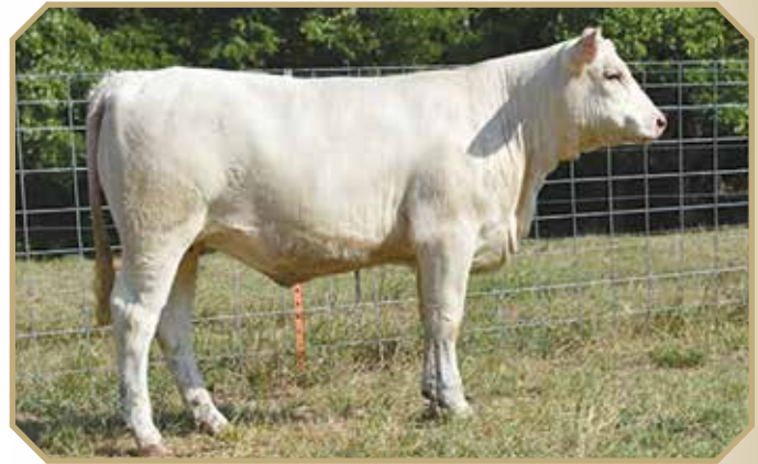
HF EVERLEE E854 selling as Lot 15

VCR SIR DUKE 914 PLD HF FANDANGO B34 ET EM889223 RE MS DUKE 34 ET WCR SIR DUKE 761 WCR MISS MAC IV 534 LHD CIGAR E46 CR MISS DUKE 172 RE MR EXCELLENCE L50 PET RE MS EXCEL 854 F1151408 RE MS LEADER 411 P WCR SIR FAB MAC 809 CJC MS ALI MARK E18 ABC LEADER BHD MS CIGAR K1516