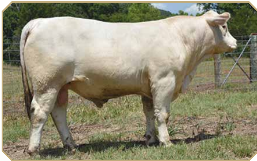
HF SKYNYRD EZ50 selling as Lot 2

Extremely correct bull with super display of muscling, bone, volume, and depth of rib. This exciting young sire brings the best of his very proven sire, Hi Def U08 to the forefront. For years his heifers have been some of the most highly sought-after females in the breed. Their stoutness, correctness, performance, and maternal ability has enabled his long tenure in the program. Hi Def's dam was a very heavy milking Smooth Deal daughter, (He was a former AICA Milk Trait Leader). With Lynyrd's dam being a daughter of a current AICA Milk Trait leader, Cooley Royce, you can feel assured of the maternal ability of this outstanding herd sire's ability. His superb weaning weight also reinforces the ability of the Hi Def's to wean heavy, market topping calves!