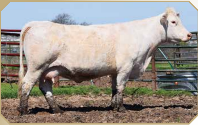
BC MS E46 DUKE X38 PET Donor dam of Lot 37