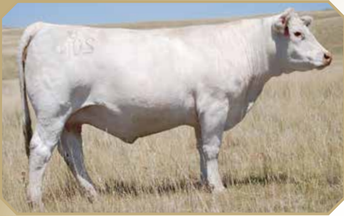
JDJ MS CIGAR B2011 P ET Donor dam of Lot 47 embryos