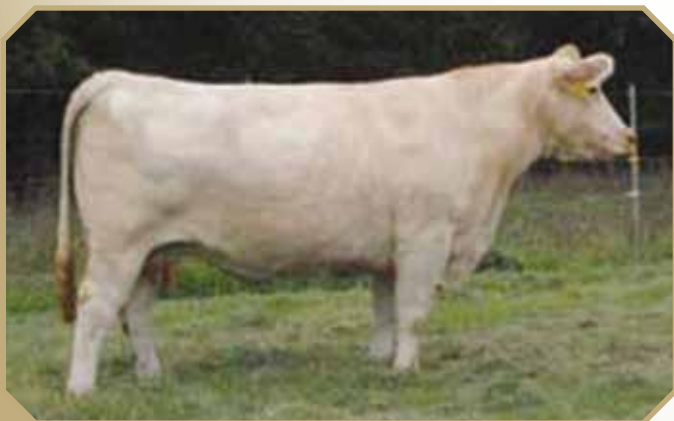
PR DUKES TRADEMARK 306 P Donor dam of Lot 19

Excellent calving ease and birth weight daughter of HF Snake Charmer, who traces to the JB433, the dam of XJ433, the dam of lot 3 and HF Remedy! C74 is one of the original cows selected from DeBruycker's to establish the Charolais program at Hudspeth. She had 13 calves with several daughters still in herd. If you want great performance, production, fertility and longevity, this genetic package awaits you!