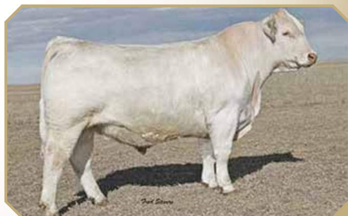
LT RIO BRAVO 3181 P His progeny sell!