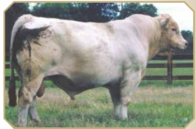
M6 GAIN & GRADE 927 PLD His genetic influence sells!