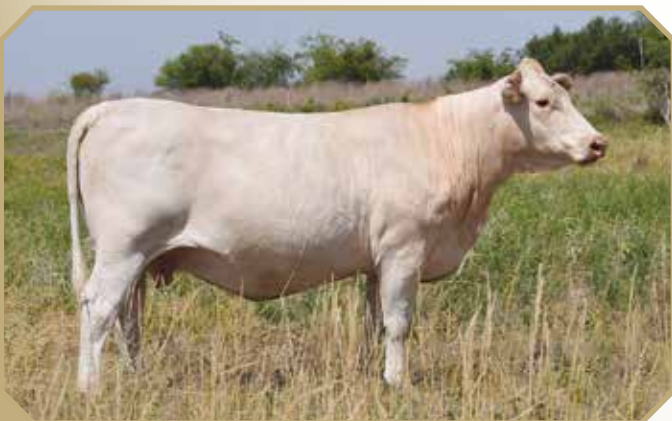
KR MS DUKES FIELD 302 selling as Lot 48