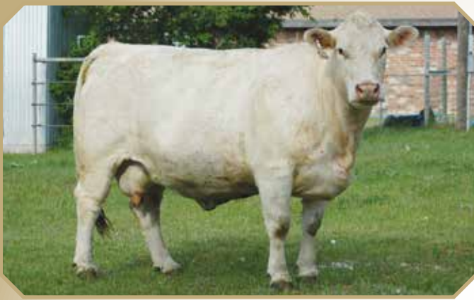
D & D MS WINDY 2816PLD ET Donor dam of Lot 52