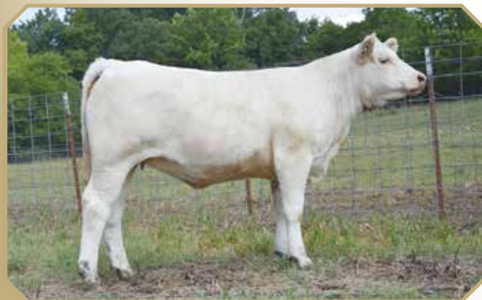
RS MS MAXHI E75

You absolutely love the pattern on this exceptional heifer. Long, extended neck, super strong, thick topped, excellent bone, and tremendous volume. She has that special brood cow look that you know will perform. Her pedigree includes some foundation Hudspeth genetics that have had a major influence in the herd. The M075 cow had 8 calves and she blended perfectly with Hi Def.