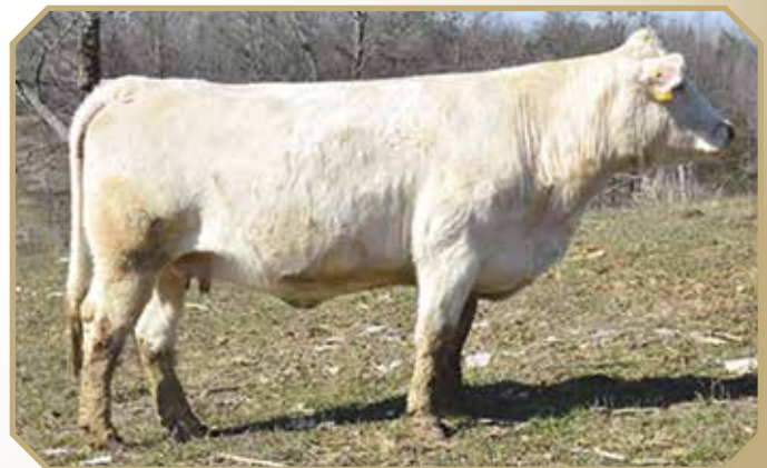
KTR MISS JUGGER C276 Donor dam of Lot 36