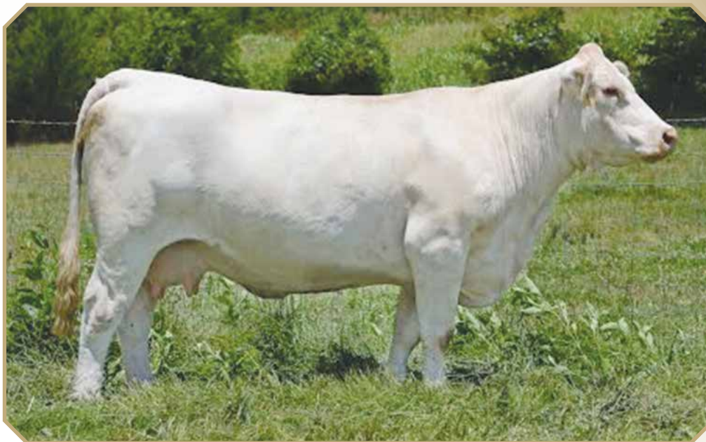
M6 MS E46 QUALITY4241PET Flush opportunity selling as Lot 20