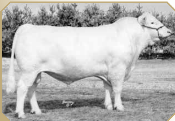
BALDRIDGE KOJACK 29K His progeny sell!