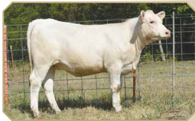
HF ELECTRA EU153 selling as Lot 9

LT LEDGER 0332 P LT BLUEGRASS 4017 P JDJ MAXIMO A18 P M841630 LT BRENDA 6120 PLD JDJ MS TRUEMARK Y322 X JDJ TRUE MARK T39 P JDJ MS ICE R2033 LHD CIGAR E46 LHD MR PERFECT Y416 JDJ MS CIGAR U153 F1100436 LHD MS CLASSIC BELL X613 JDJ MS KODAK L753 MD MR KODAK E174 LHD MS PERFECT D621