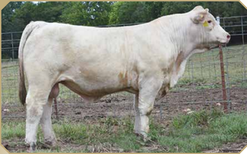
HF LYNYRD EA113 selling as Lot 1