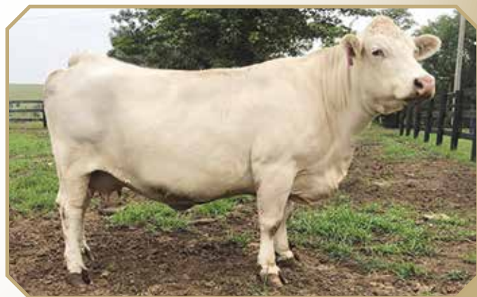
FINK PRIDE 9610 6871 GM Donor dam of Lot 69 embryos

SPARROWS FARGO 811U RBM FARGO Y111 EM809088 HC RHINESTONE 5100 M6 GRID MAKER 104 PET FINK PRIDE 9610 6871 GM EF1118569 FINK PRIDE 6871 4871 GG WINN MANS LANZA 6105 SPARROWS DELIGHT 74L LT EASY PRO 1158 PLD HC JACK 2082 WCR SIR TRADITION 066 VCR MISS MAC IV 317 M6 GAIN & GRADE 927 PLD FINKSPRIDE487180239108ET