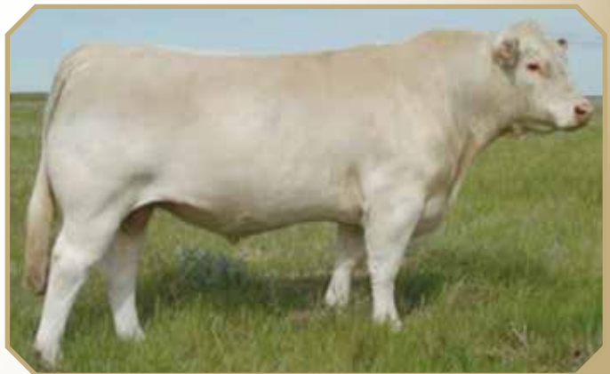
LT LEDGER 0332 P His genetic influence sells!

LT BLUEGRASS 4017 P LT LEDGER 0332 P M791626 LT BRENDA 6120 PLD LHD CIGAR E46 AC MS SOUTHERN MIX 508 P ET EF1235059 JDJ MS DYNASTY L428 LT ASSERTION 1277 P LT PEARL'S BREEZE 2236 P LT RIO BRAVO 3181 P LT BRENDA'S EASE 3055PLD LHD MR PERFECT Y416 LHD MS CLASSIC BELL X613 LHD DYNASTY C584 LHD MS FRANZ E147