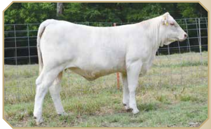
HF FANTASY FX433 selling as Lot 3

This powerful prospect is a maternal sib to the high selling bull in the 2017 Gathering Sale, HF Remedy EZ433, at $10,000 going to Plyler & Son, Bowen Farms and Morrison Charolais. This heifer definitely shows promise as a donor cow with the solid credentials and performance she exhibits. One of our junior herd sires, HF Snake Charmer CS433, dam is SJ433, she is out of the JB433 cow, who is also the dam of Fantasy's dam, XJ433. Great cow families always rise to the top with the best progenies, year after year! Her younger photo shows a very fast-growing heifer with excellent bone, superb length and stretch. As she is starting to mature more after weaning, she is developing plenty of volume, depth, and rib shape with an excellent top line! Hudspeth are willing to work with new owner on possession. They have an excellent relationship with their embryologist and can keep the heifer and flush for both, while working with new buyer on sires.