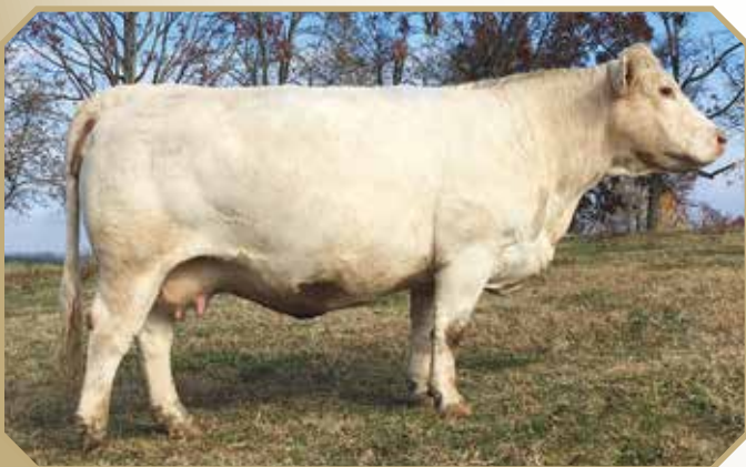
EB MISS 3313 514 ET PLD Donor dam of Lot 40