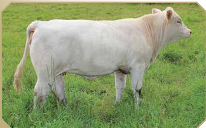
DOUBLE-H DIAMOND DOLL 717E ET selling as Lot 66