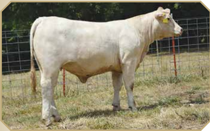
HF EBBIE EA620 selling as Lot 12

This big, stout powerful performance heifer shows the ability of Hi Def to increase the profit picture with more pounds and power. A maternal sister sold in the 2015 sale to Bella Parker of Texas. With the Nancy influence, you will always get the advantage of many years of stacked, high-end genetics. Her Royce daughter has been a great milking female with super quality udder.