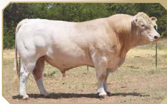
RE MAX DYNASTY 510 ET Sire of Lot 49A

M6 GRID MAKER 104 PET M6 RIGHT NOW 5239 PLD ET M718494 M6 MS E46'S DUKE 248 PET WCR SIR TRADITION 066 VCR MISS MAC IV 317 LHD CIGAR E46 M6 MS DUKE 009 PLD LHD CIGAR E46 HALES MRS CIGAR 622 ET F945702 LHD MS SMOOTHDEAL B916 LHD MR PERFECT Y416 LHD MS CLASSIC BELL X613 SMOOTH DEAL RC 9144 LHD MS LAND JO W202