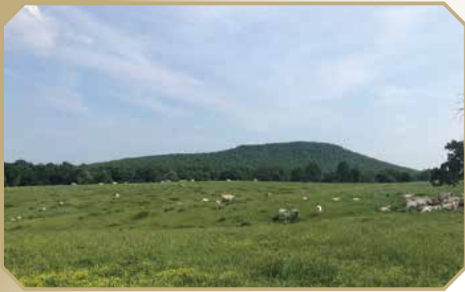
Charolais cattle dot the hillside at Hudspeth Farms in St. Joe, Arkansas!