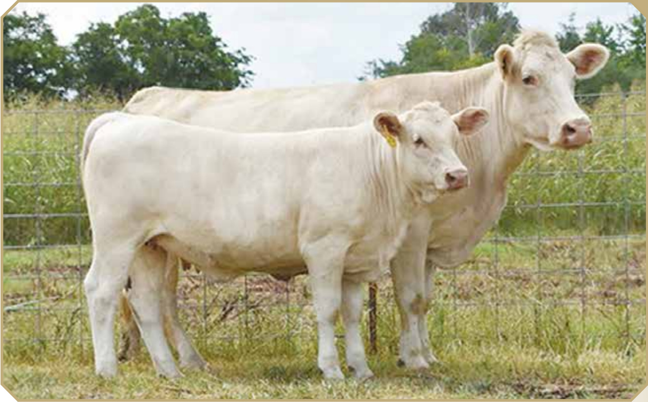
HF FANTASY FX433 & HF MS DUKE XJ433