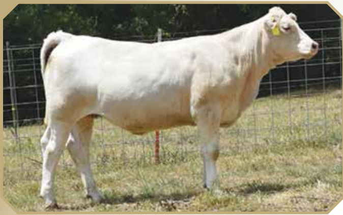
HF ERIN EA402 selling as Lot 16