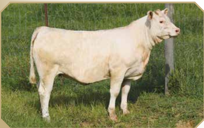
LWF MS LEGAL AIDE 107 selling as Lot 60

BW: 80 lbs. Sells open. A very sharp, feminine, broody looking heifer sired from genetics of the three powers of DeBruycker foundation – Ali Mark, Trademark and Cigar. Cigar is one of the few bulls that you can successfully line-bred many times and not give up any performance or quality. Legality daughters are making tremendous broodcows. Little W Farm