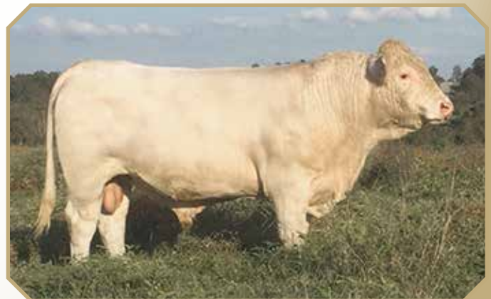
HF FANDANGO B34 ET His progeny sell!

VCR SIR DUKE 914 PLD M297007 WCR MISS MAC IV 534 LHD CIGAR E46 RE MS DUKE 34 ET F988929 CR MISS DUKE 172 BR DUKE 261 WCR MISS TRADITION 8335 WCR SIR FA MAC 2244 MISS DOC 509 LHD MR PERFECT Y416 LHD MS CLASSIC BELL X613 BR DUKE 261 WCR MISS PERFECTION 806