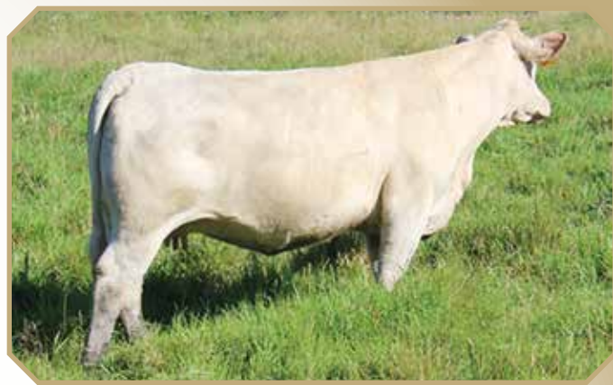
DOUBLE-H RAMONA 536C ET selling as Lot 67

M6 COOL REP 8108 ET M6 BELLS & WHISTLES 258 P M829092 M6 MS GAIN & GRADE 552 P M6 COOL DUDE 6463 P ET SR LADY EASE 914 ET M6 GRID MAKER 104 PET BCF MISS MAC 74 JDJ SMOKESTER J1377 P ET SM MS SMOKESTER Y150 P F1143150 SM MS TOP CLASS S667 LHD CIGAR E46 JD MS COMMANDER B309 SM TOP CLASS N365 SM MS TRADEMARK N327