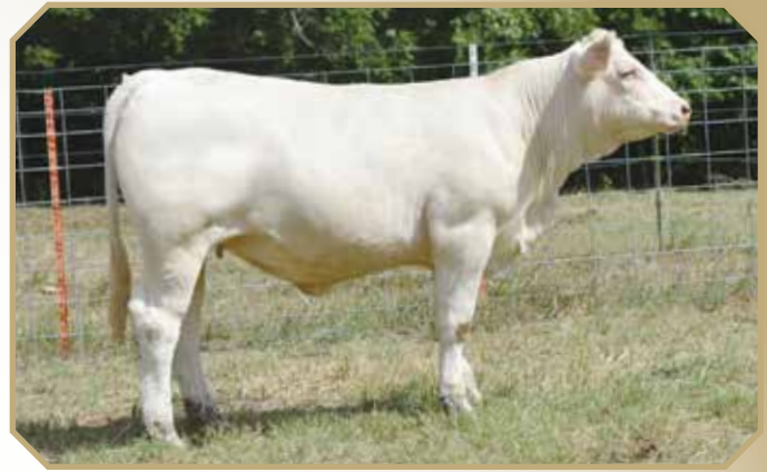
HF ELGA E551 selling as Lot 14

VCR SIR DUKE 914 PLD HF FANDANGO B34 ET EM889223 RE MS DUKE 34 ET WCR SIR DUKE 761 WCR MISS MAC IV 534 LHD CIGAR E46 CR MISS DUKE 172 VCR SIR DUKE 914 PLD RE DUTCHESS 551 ET EF1130121 RE MS DUKE 34 ET WCR SIR DUKE 761 WCR MISS MAC IV 534 LHD CIGAR E46 CR MISS DUKE 172