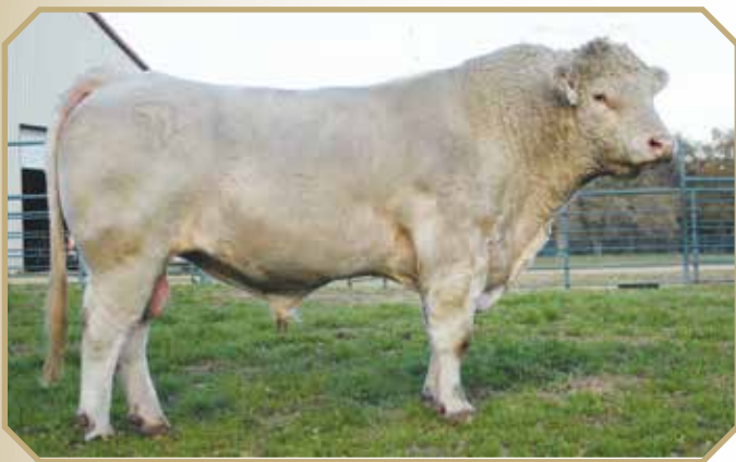
BHD REALITY T3136 P His progeny sell!