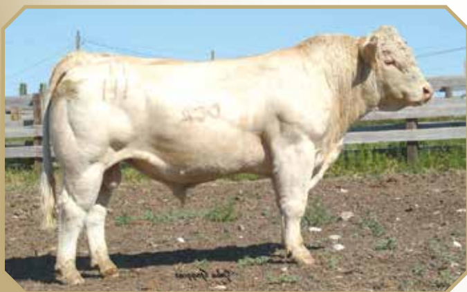
CJC ILLUSION N111 His progeny sell!