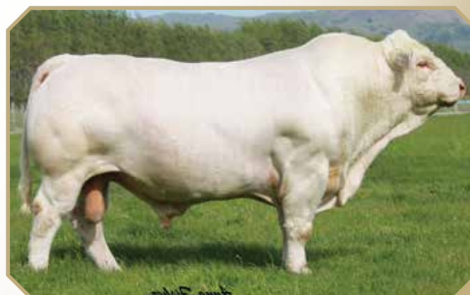
SILVERSTREAM EVOLUTION E Sire of Lot 21 embryos

A great opportunity to invest in an exciting outcross to U.S. genetics with the very popular New Zealand bull that is extremely popular already in Canada and the U.S. Another chance for you to lead and not follow!