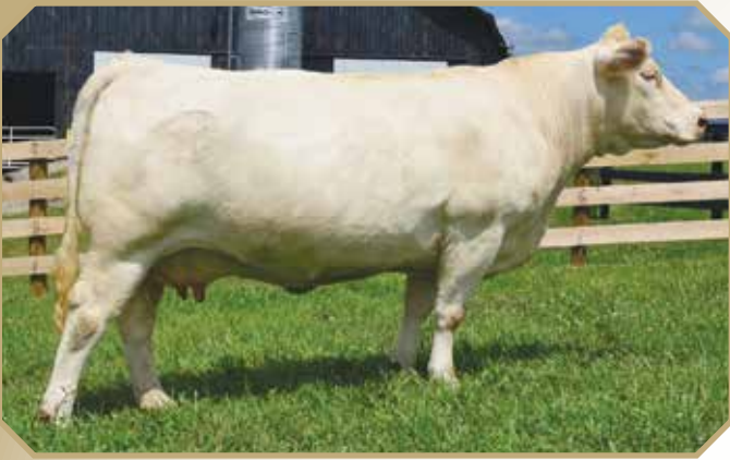
BHD MS CURLIN X292 Donor dam of Lot 70 embryos