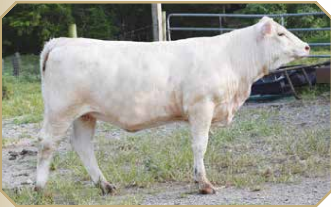
LWF LADY MAXIMO 9217 selling as Lot 59

BW: 74 lbs. Sells open. A very feminine, complete female, long-sided, angular necked, and square hipped. Combined with the strong milking and fleshing ability of Bluegrass, this stout young prospect has a great deal to offer. Good numbers all-around enhance her value. The Sweetheart cow traces to older lines of Performer 181, Expectation 269 and Courage. Little W Farm