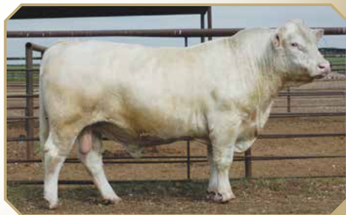
JDJ RESOURCE Z365 P His progeny sell!

LHD BOSQUE S1195 JDJ RESOURCE Z365 P M826959 JDJ MS SPUR R120 JDJ WIZARD S333 P BARA MS 22Y WIZARD 50A P F1255539 BARA MS M09 CIGAR 22Y P ET CJC SMOKIN TRADE P115 LHD MS AUTUMN P1247 SSR MR SPUR 3328 JDJ MS SMOKESTER N290 MD SENTINAL RULER G1520 JDJ MS MARKSMAN H40 LHD CIGAR E46 WM MS AGATHA FAB M09 PET