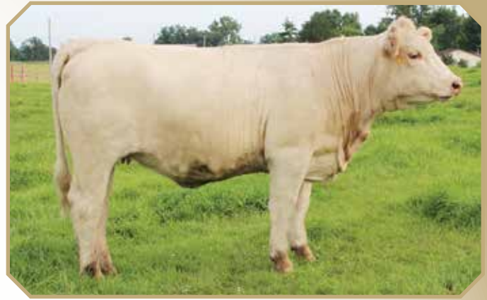
DOUBLE-H NEW WHISTLE 710E ET selling as Lot 61