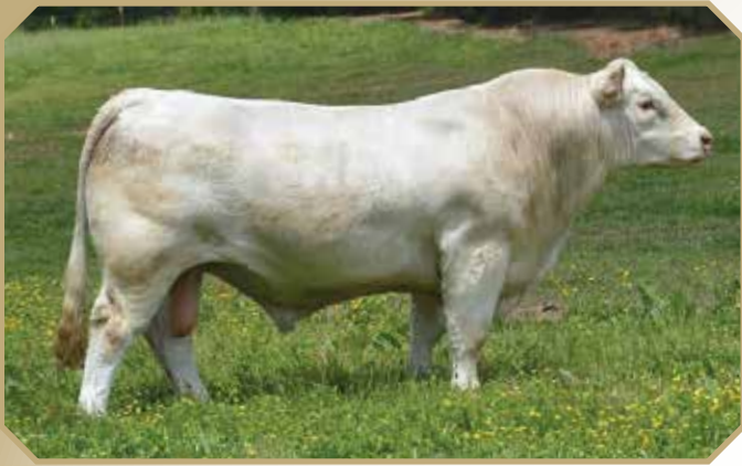
JDJ MAXIMO A18 P His progeny sell!

BW: 77 lbs. Sells open. Another power mating blending Maximo with Royce for muscling and milking ability. Low birth weight and calving ease is an added plus for this future brood cow. Cookie Cutter is a combination of Mac 2244 and Duke 914 mated with a granddaughter of HEP Serious Business 5ET to obtain the 4310 cow. A very complete, functional, and broody prospect. Little W Farm