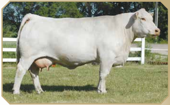
M6 MS E46'S DUKE 248 PET Maternal granddam of Lot 55 embryos

SCHURRTOP HCR RANCHER COOLEY ROYCE 1107T39 M745957 MS COOLEY S DUKE 1107N60 M6 GRID MAKER 104 PET C5 MS 104 DUKE 1265 P ET EF1036151 M6 MS E46'S DUKE 248 PET SCHURRTOP EASE 8953 PLD SCHURRTOP ML 6056 1184 P WCR SIR DUKE 17J ET P MS CCR TRADIT 1107K7 PET WCR SIR TRADITION 066 VCR MISS MAC IV 317 LHD CIGAR E46 M6 MS DUKE 009 PLD