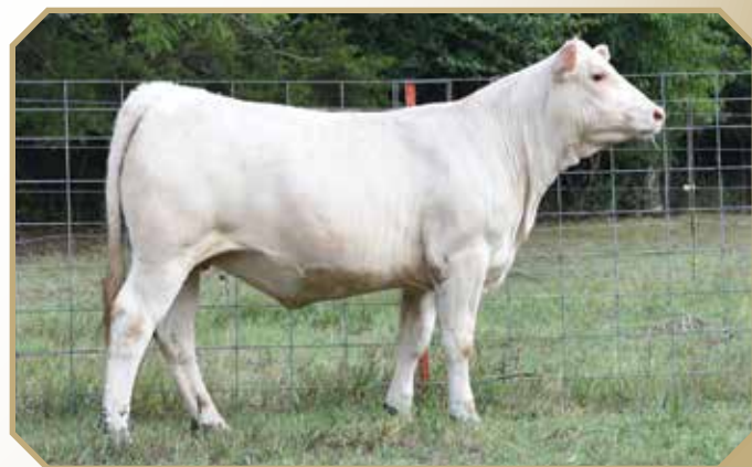
HF ELZA E90 selling as Lot 10

LT LEDGER 0332 P LT BLUEGRASS 4017 P JDJ MAXIMO A18 P M841630 LT BRENDA 6120 PLD JDJ MS TRUEMARK Y322 X JDJ TRUE MARK T39 P JDJ MS ICE R2033 4-L UNLIMITED YL06 PLD BCR POLLED UNLIMITED 003 HEH YL06'S MAMIE 90 F1060696 4L MISS MAC P505 MOORES MS MAKER 7166 M6 MORTGAGE MAKER 590PET MISS GCR SUPREME G56