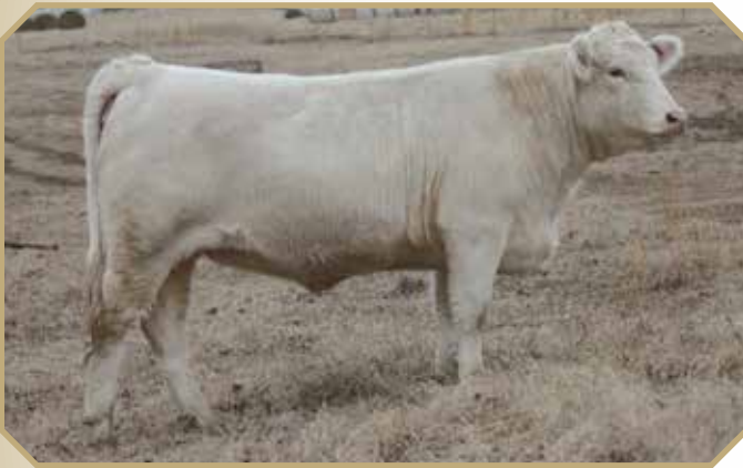
RS MS RESOURCE JO B91 selling as Lot 53