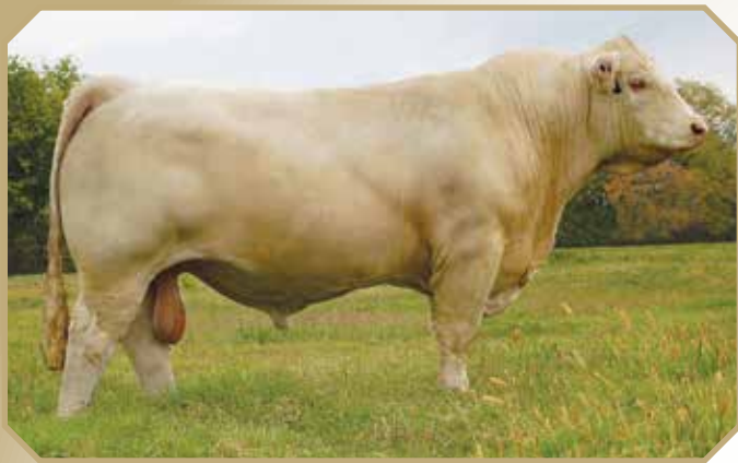
CWC TRIFECTA J825 His progeny sell!