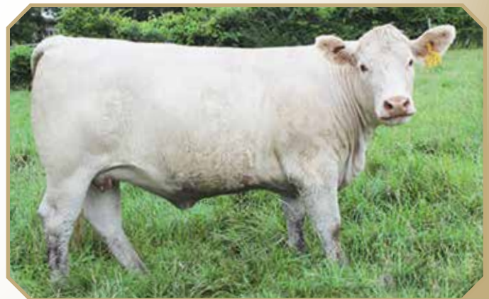
DOUBLE-H SHINING CHROME 615D selling as Lot 63