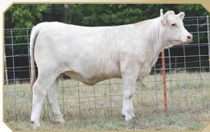
HF ECHO E54T selling as Lot 8

LT LEDGER 0332 P LT BLUEGRASS 4017 P JDJ MAXIMO A18 P M841630 LT BRENDA 6120 PLD JDJ MS TRUEMARK Y322 X JDJ TRUE MARK T39 P JDJ MS ICE R2033 CJC ILLUSION N111 LHD PERFECT ALI G1312 ET BARA MS ILLUSION 54T F1096700 CJC MS PRODUCTIVE K1645 BARA MS CIGAR 72P LHD CIGAR E46 WA MS ASTRO MARK