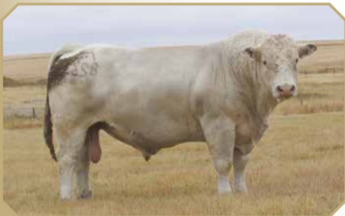
LHD ESTABLISH M826 His genetic influence sells!