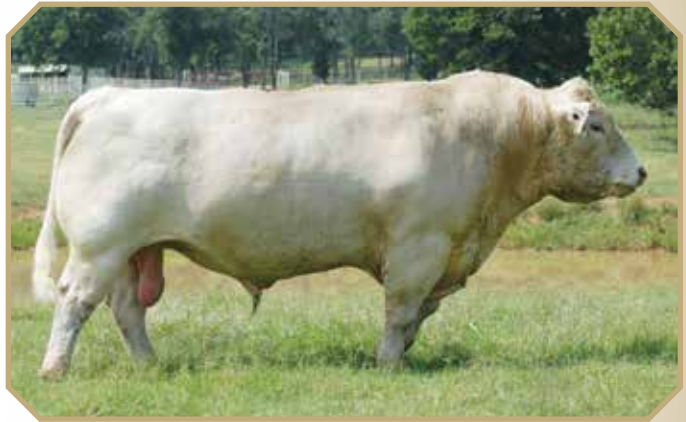
RE MYSTERY 829 ET His genetic influence sells!

LT LEDGER 0332 P JDJ MAXIMO A18 P M841630 JDJ MS TRUEMARK Y322 RE MYSTERY 829 ET RS MS 5114 MYSTERY 1812 F1160145 M6 MS FUNCTION 5114 LT BLUEGRASS 4017 P LT BRENDA 6120 PLD JDJ TRUE MARK T39 P JDJ MS ICE R2033 CJC ILLUSION N111 RE MS DUKE 34 ET M6 FUNCTION 169 PET M6 MS DUKE 025 PLD