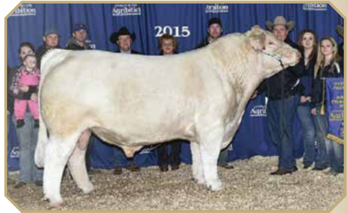
CML DISTINCTION 318A His progeny sell!