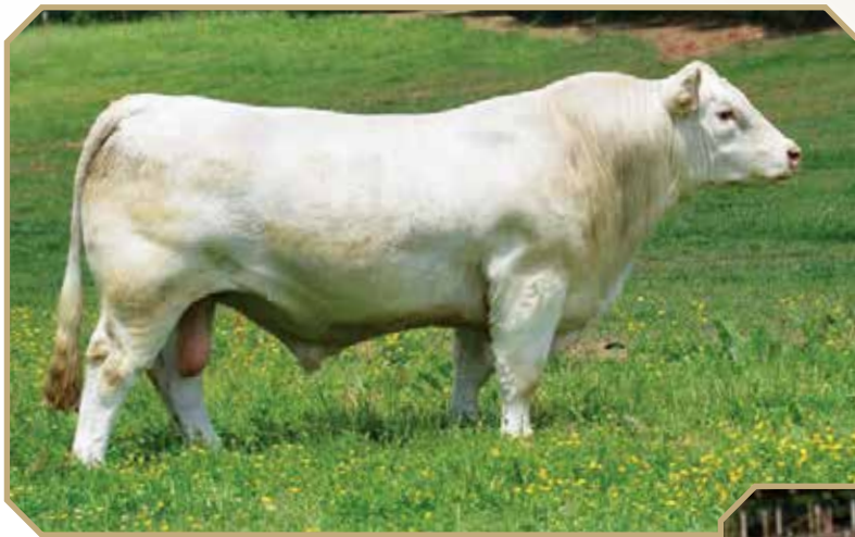
JDJ MAXIMO A18 P M841620

Join us for your chance to win 10 units of semen on each of these herd sires!